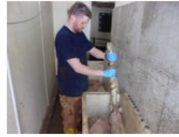
2. Application of Electrocution (one person)