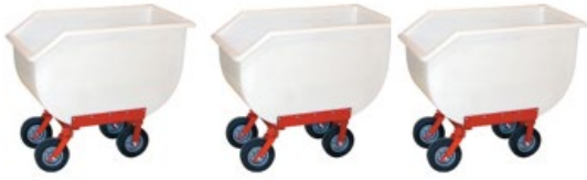
1. Pre Loading Carts (2 people)