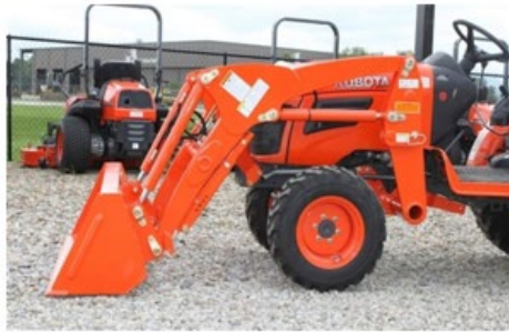
4. Removal (one person)